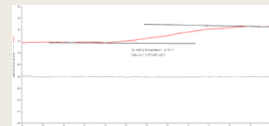
Figure 3. Low temperature T g detection at different heating rates. Red curve: 200 °C/min; Black curve: 10 °C/min