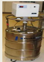
CLN2 liquid nitrogen cooling accessory

The method started with a one minute isothermal holding at -70 °C, and then heating from -70 °C to 250 °C at 200 °C/min and followed by a one minute isothermal holding at 250 °C. For comparison purpose, a conventional slow heating at 10 °C/min was also performed.