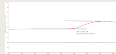
Figure 2. High temperature T g detection at different heating rates. Red curve: 200 °C/min; Black curve: 10 °C/min