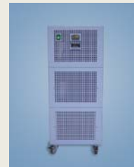
Intracooler 3 cooling accessory