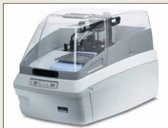
DSC8000/8500 with Autosampler

In this study, the polyurethane acrylate sample is from a coating on mold release paper which is used during artificial leather molding. The new DSC8000 double furnace power compensation DSC with liquid nitrogen cooling accessory CLN2 was used to detect T g .